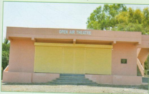
Open Air Theatre